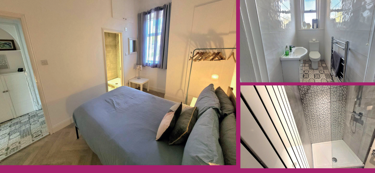
This one bedroom ground floor flat is situated in one of the most sought after locations in the heart of Balloch and minutes walk from all the local amenities Balloch has to offer including shopping, bus and train services. Loch Lomond Shores, Balloch Castle country park and the views of Loch Lomond all on your doorstep.

The property has gas central heating and double glazing. Timber entrance door gives access to the vestibule and entrance hallway, large recess cupboard which also has plumbing for automatic washing machine within. A good size lounge with open plan kitchen has window facing to the front of the property, the kitchen has a range of base and wall mounted storage units in white, inset electric hob with oven below and extractor above. There is a good size bedroom with window facing to the front, ample floor space for free standing bedroom furniture.