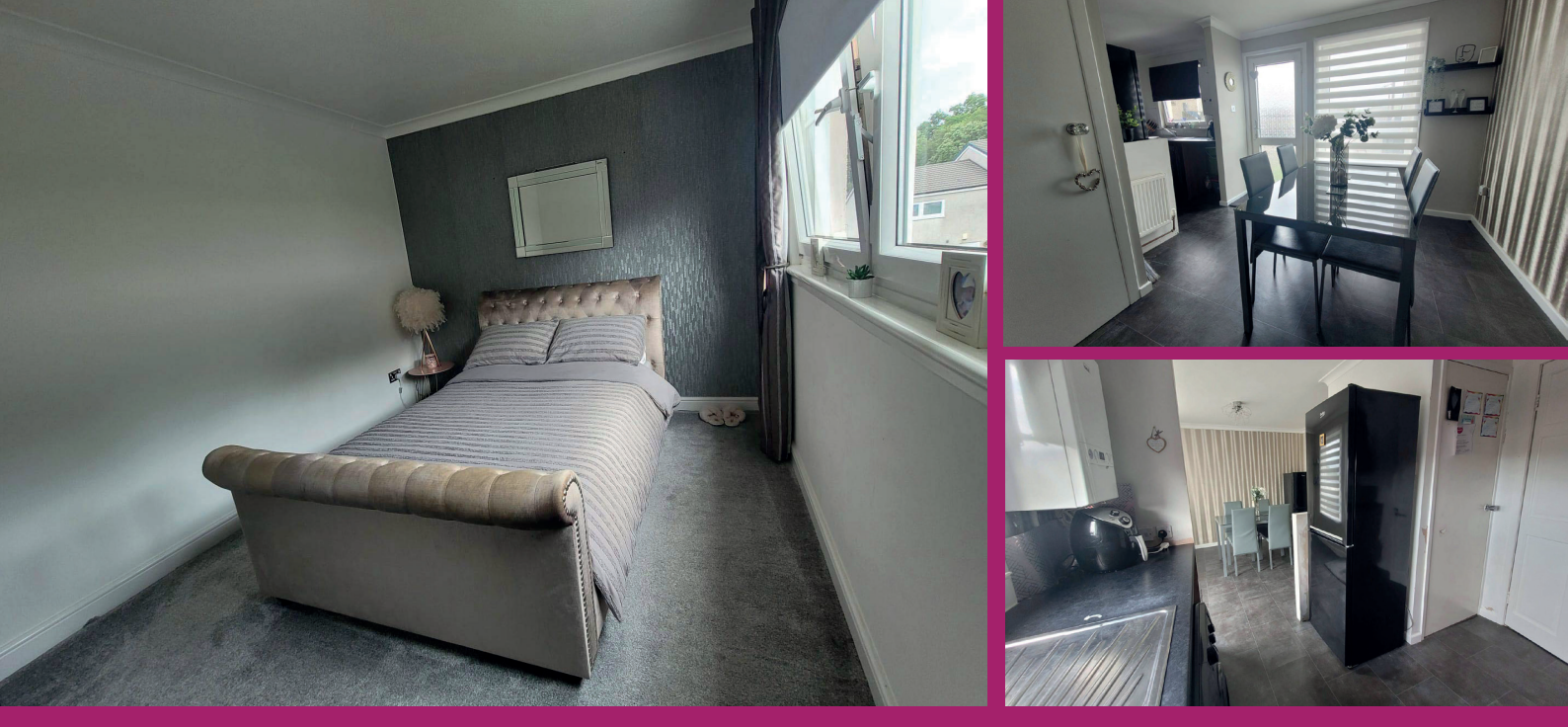
Popular location, the agents would like to offer this immaculately kept 2 bedroom mid terrace villa particularly targeted at the buy to let market as the property has in place a sitting tenant.

There is a lawn front garden and particularly private and well maintained west facing rear garden. New external insulation cladding has been installed to both the front and rear walls of the property. The property has gas central heating and double glazing.